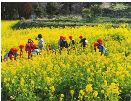
landscape around the kindergarten

Since then, we took care of their children every time they go home, and children in our kindergarten could gain an opportunity they experience